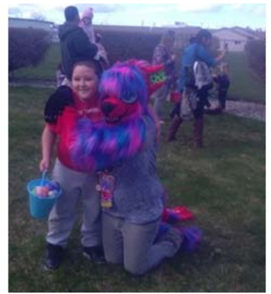
Ghost Gamers completed their community service by helping with the Quincy Hospital Egg Hunt. They helped hide eggs and set out snacks for the kids.