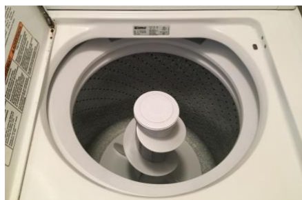
Figure 2: The central agitator in top-loading washing machines is thought to contribute to higher microfiber releases compared to front-loading washing machines.

Three primary trends found in this set of studies were: