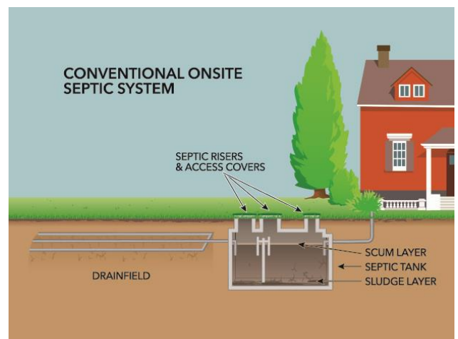
Figure 3: Septic treatment systems also have the potential to introduce microfibers into the natural environment. While some might be captured in the tank, others could escape into the drainfield (leachfield) pipes, where they could clog soil pores or be carried into ground or surface waters.

It was initially thought that septic systems did not carry the same risks of releasing microfibers as the sewage system. That understanding appears to be changing as scientific interest has increased into the role of soils as microplastic reservoirs. While it appears that no peer-reviewed studies have yet looked at microfibers in septic tank effluent, the septic industry has become more concerned about the issue. Microfibers' small size means they're resistant to settling in the septic tank and may find themselves in the drainfield (leachfield), where they may eventually clog the soil pores, necessitating system or drainfield maintenance or replacement. If they do not clog the soil pores, the microfibers could be transported by water or soil movement towards groundwater aquifers or the surface, where they may become runoff and re-enter other reservoirs. In many cases in the Puget Sound, septic drainfield pipes are buried only six inches underground, meaning fibers in a saturated drainfield would not have far to travel to reach the surface.