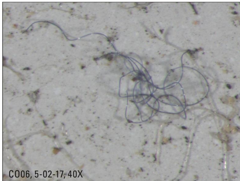
Figure 1: They may seem small, but the microfibers we shed from our clothing may have significant impacts on natural ecosystems. USGS Report 2019-1048 ( link).