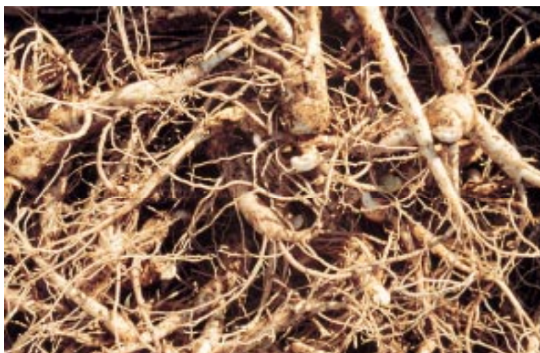
Freshly dug root waiting to be washed

Growers select sites possessing well-drained sandy loam soil. Some growers have installed agricultural drain tile in their fields where winter flooding has been observed. Poorly drained ground has been found to be the leading cause of root rot in established gardens. In the Northwest, ginseng plantings are predominately established on pasture ground. All existing vegetation is cleared using