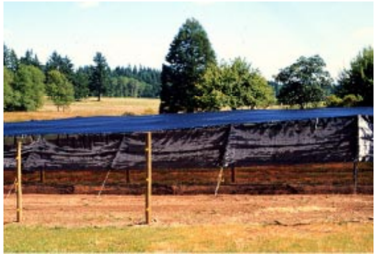
Modern plastic-weave shade structure

on a human hand). In year two a stalk emerges which supports two leaves, each with five leaflets. In years three and four, the emerging stalk gives rise to three and four leaves, respectively, once