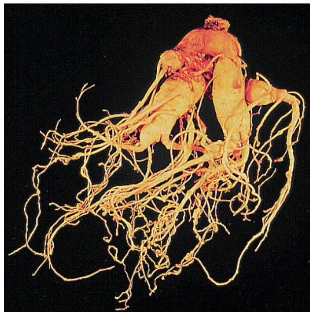
Root-knot nematode damage. Note swellings on root hairs.

The crop grown before ginseng plays a role in nematode population dynamics. Alfalfa can