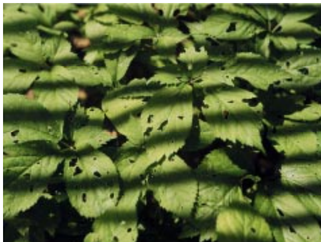
Slug damage on ginseng plant leaves.

APPLICATION: Broadcast 20 to 40 pounds over