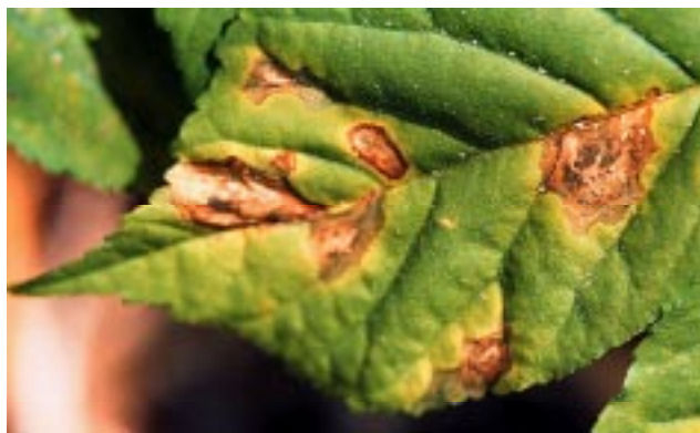
Alternaria leaf blight lesions, circular and angular.

Alternaria leaf and stem blight caused by Alternaria panax , is the most common disease of ginseng throughout the world (6). It has been isolated in ginseng growing in eastern Washington, but not in areas west of the Cascades.