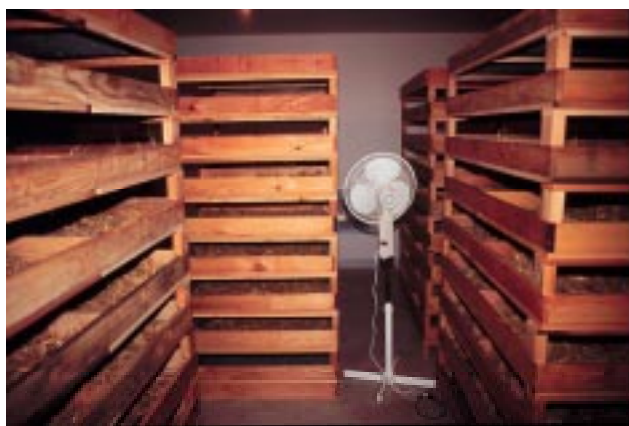
Ginseng drying shed, showing shallow trays and fan to distribute warm air.

In September and October new fields are prepared for planting. If they have been planted into summer cover crops the fields are plowed, disked and beds shaped for September seeding. In gardens ready for digging (year four) all posts, wire, and shade cloth must be removed. For any garden over an acre in size a potato harvester pulled behind a tractor is used to lift the roots to the soil surface where they can be picked up by hand. After freshly harvested roots wilt for 3-4 days (to help improve their color), they are washed carefully with clean water. If roots are destined for the fresh trade they are placed into cold storage