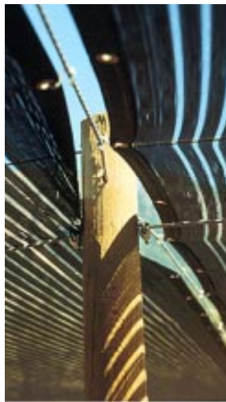
Posts, wire, and 80% shade panels used to shield plants from the sun's rays.

In order to shield the ginseng plants from the harmful rays of the sun, growers use 80% woven shade panels, suspended by 8-10 ft. posts and 1/8 in. wire rope over their garden throughout the growing season. During the winter the wire rings used to secure the panels to the wire rope are cut, thus allowing the panels to be furled (gathered together) over the winter.