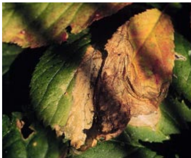
Botrytis cinerea lesion on cultivated ginseng leaves.

Of the foliar disorders affecting ginseng in areas west of the Cascades, Botrytis leaf blight is the most common. The cool, cloudy weather, with abundant spring rainfall, sets the ideal conditions for pathogen spread. Botrytis cinerea overwinters in the debris and surrounding vegetation near the ginseng garden (5). In the spring the fungus begins to grow and release spores which can be carried by